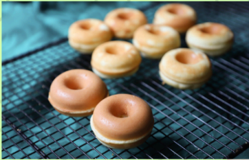
Glazed Donuts $15 / dz.